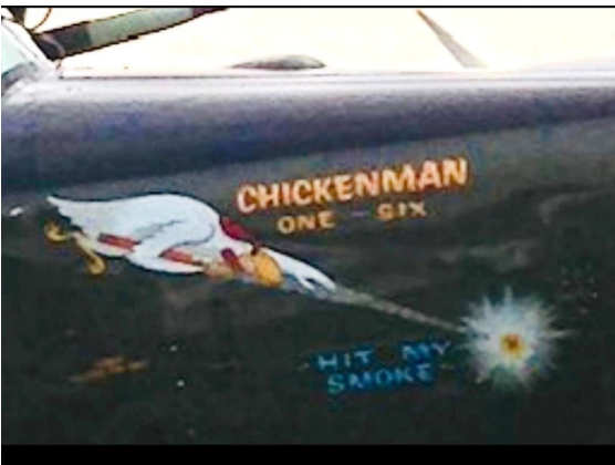
Left: Bob's beautiful, but somehow incomplete, artwork. Right: 2010 photo of Bob's nose art.

and asked a local Vietnamese artist to paint a bald eagle on the nose. Well, they don't have bald eagles in Vietnam, so the artist asked what a bald eagle was. The answer: "A very big bird." To which the artist replied, "You mean like a chicken?" And so, due to a regional difference in biodiversity, the "Chickenman" call sign was born. My O-1 had been rebuilt in 2016 after a serious 2015 ground loop incident. I assumed that it had been totally repainted in 2016.